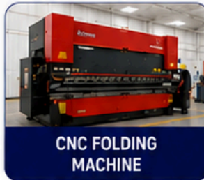
CNC FOLDING MACHINE