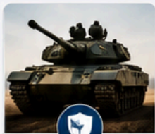
DEFENSE & MES