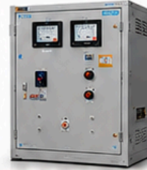
48V / 110V BATTERY CHARGER