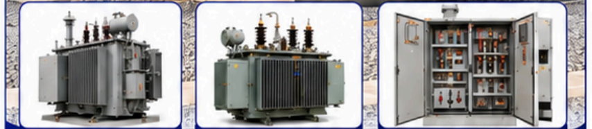
1 MVA POWER TRANSFORMER