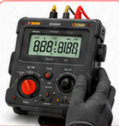
1000V/500V DC MEGGERS

Each assembly is tested for visual, mechanical, insulation, and high-voltage performance—guaranteeing out-of-the-box readiness.