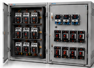
DCDB - COMPARTMENTALIZED