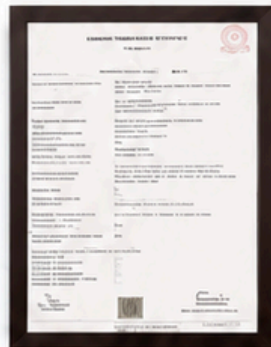
IP 65 & 54 SHORT CIRCUIT 6300A 65kA TESTED