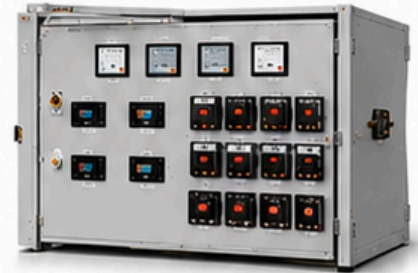
DCDB - NON-COMPARTMENTALIZED