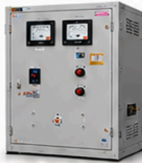
12V / 24V BATTERY CHARGER

Available in compartmentalized and non-compartmentalized designs, featuring built-in emergency DC feeder provisions to guarantee seamless operation during catastrophic AC supply failures.