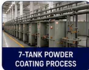
7-TANK POWDER COATING PROCESS