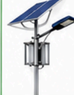
SOLAR STREET LIGHTS