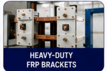
HEAVY-DUTY FRP BRACKETS