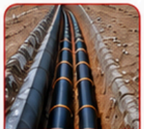
CABLE LAYING & JOINTING