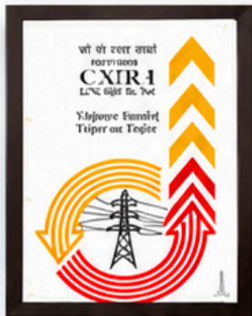
CPRI INDIA TESTED