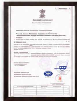
ISO 9001:2015 CERTIFIED COMPANY