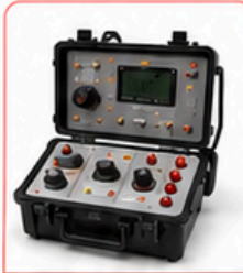
PRIMARY (1000A) INJECTION SET