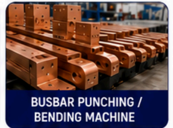
BUSBAR PUNCHING / BENDING MACHINE