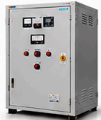
220V / 750V BATTERY CHARGER