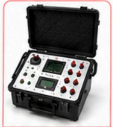
SECONDARY (5A) INJECTION SET