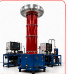
0-5kV AC HIGH VOLTAGE TEST SET